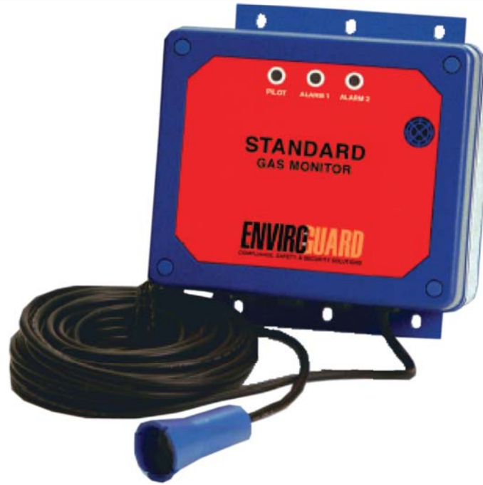
Part Number: HYD-S